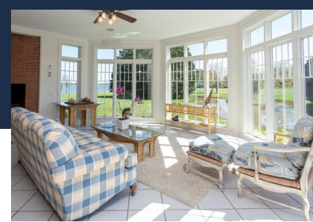
26020 BENDERS LANE, SHERWOOD, MD 21665

4 BEDROOMS | 6 BATHS | 10,781 SQ. FT. | 113+/- ACRES | BUILT IN 1999